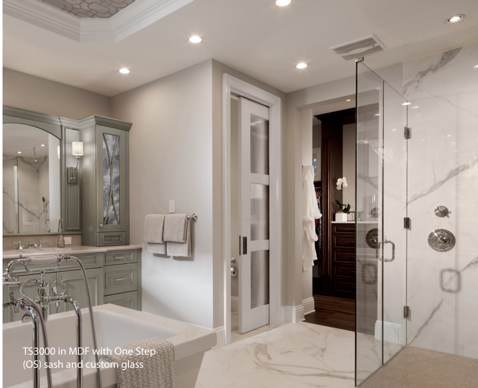
TS3000 in MDF with One Step (OS) sash and custom glass