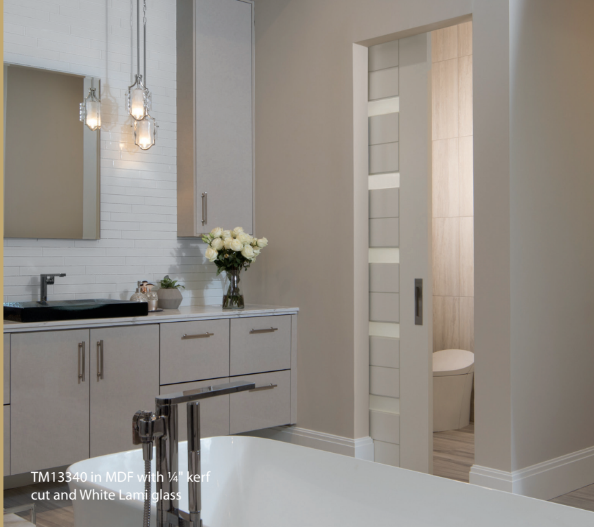
TM13340 in MDF with 1/4" kerf cut and White Lami glass