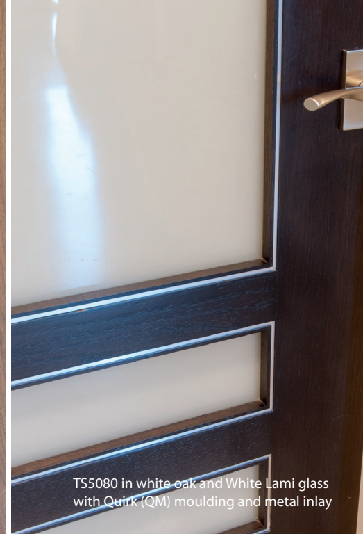
TS5080 in white oak and White Lami glass with Quirk (QM) moulding and metal inlay