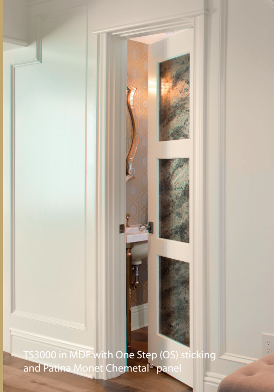
TS3000 in MDF with One Step (OS) sticking and Patina Monet Chemetal® panel