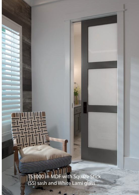
TS3000 in MDF with Square Stick (SS) sash and White Lami glass

Like furnishings and décor, doors should complement your home's architecture. TruStile has the flexibility to tailor your doors to work in a variety of applications.