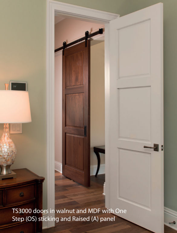
TS3000 doors in walnut and MDF with One Step (OS) sticking and Raised (A) panel