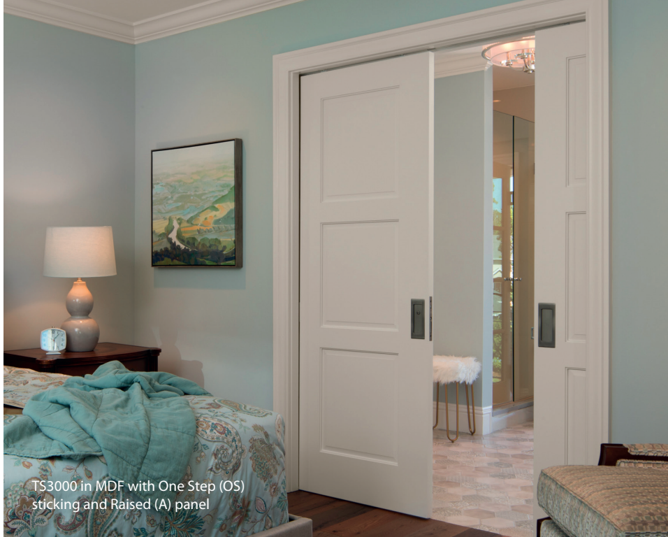
TS3000 in MDF with One Step (OS) sticking and Raised (A) panel

When every opening is designed to fit your exact specifications, we call it a TruStile Design Package. Take advantage of TruStile's flexibility and endless options to create your Design Package today.