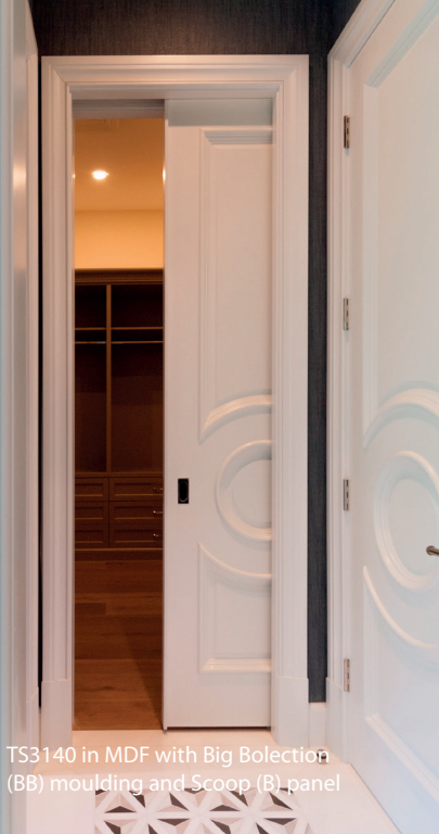
TS3140 in MDF with Big Bolection (BB) moulding and Scoop (B) panel