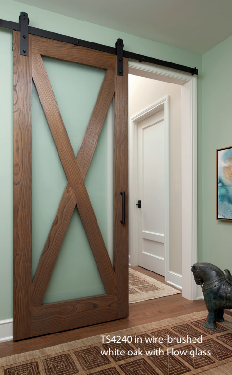
TS4240 in wire-brushed white oak with Flow glass