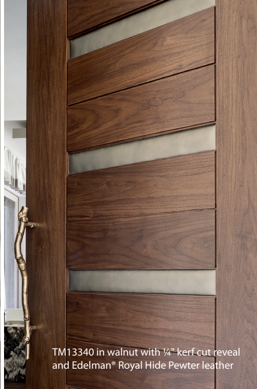
TM13340 in walnut with 1/4" kerf cut reveal and Edelman® Royal Hide Pewter leather