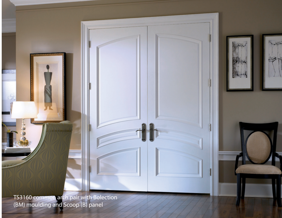
TS3160 common arch pair with Bolection (BM) moulding and Scoop (B) panel

Rather than placing two matching doors side by side, common arch pairs carry details across both doors creating a designed-in look.