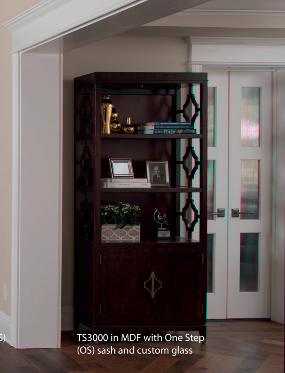
TS3000 in MDF with One Step (OS) sash and custom glass