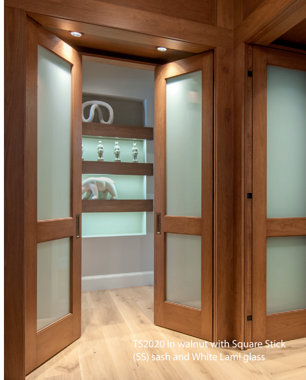
TS2020 in walnut with Square Stick (SS) sash and White Lami glass