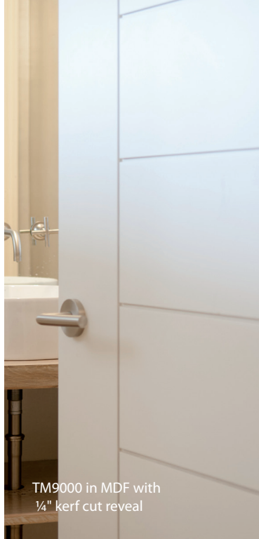
TM9000 in MDF with 1/4" kerf cut reveal