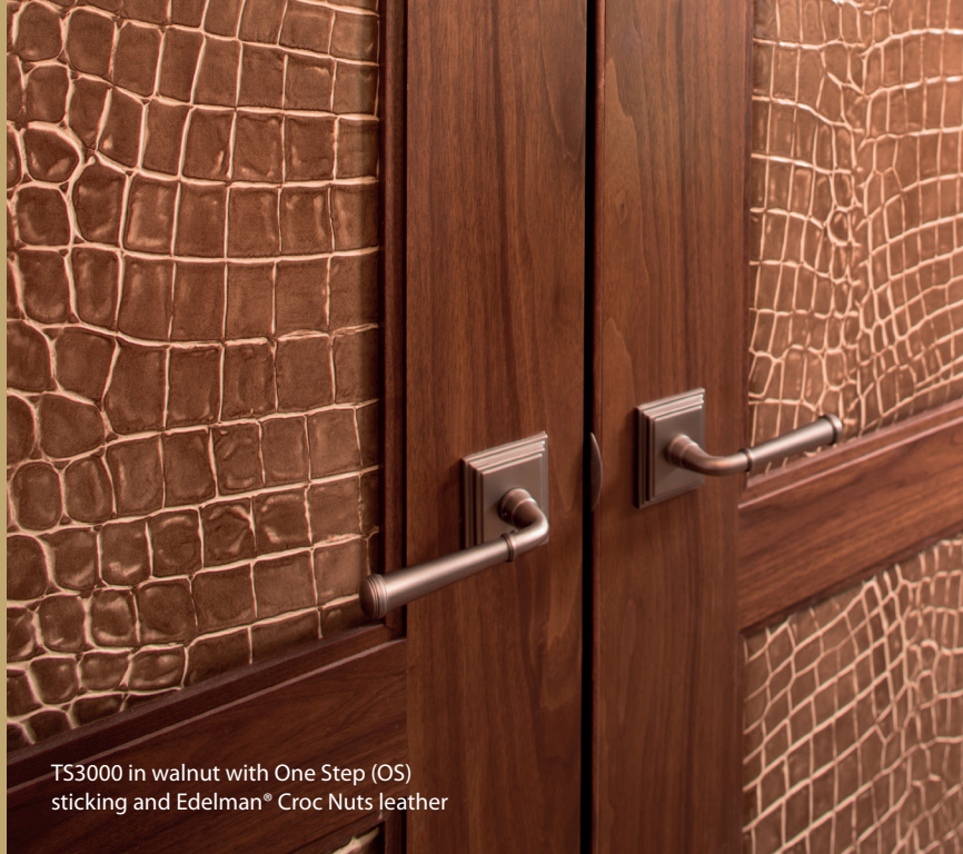
TS3000 in walnut with One Step (OS) sticking and Edelman® Croc Nuts leather