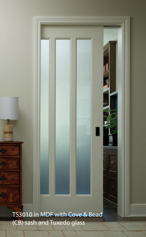
TS3010 in MDF with Cove & Bead (CB) sash and Tuxedo glass