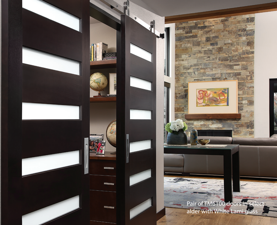
Pair of TM6100 doors in select alder with White Lami glass