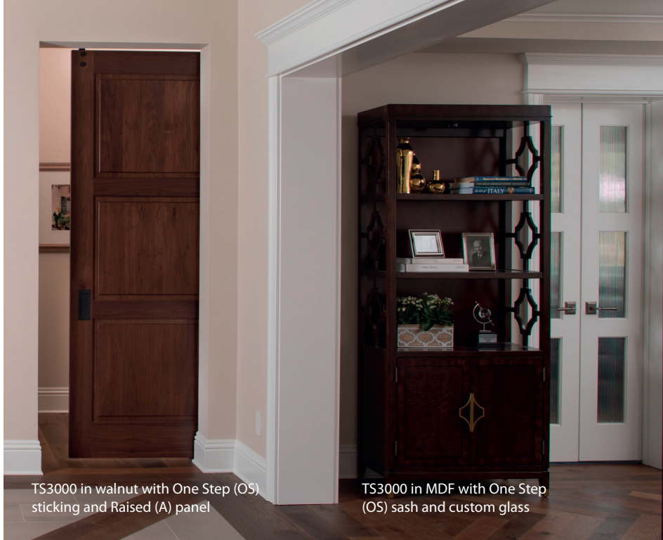
TS3000 in walnut with One Step (OS) sticking and Raised (A) panel