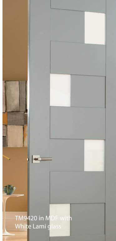
TM9420 in MDF with White Lami glass