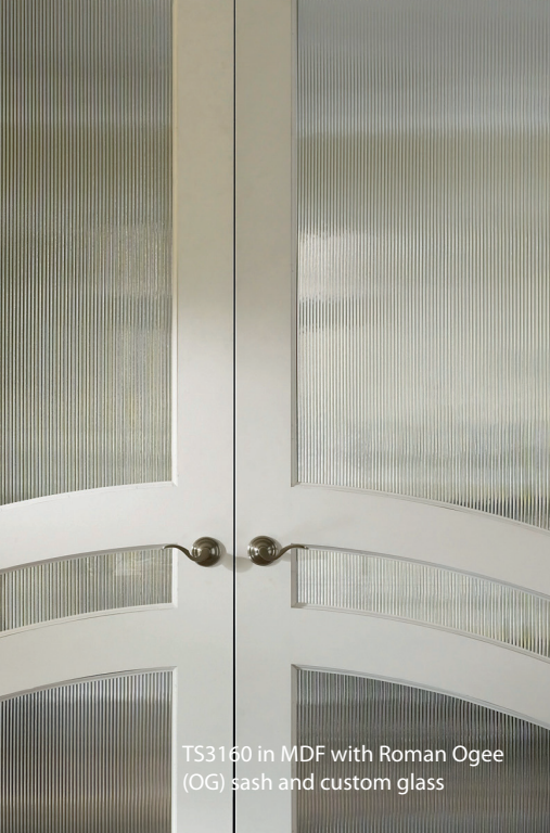
TS3160 in MDF with Roman Ogee (OG) sash and custom glass