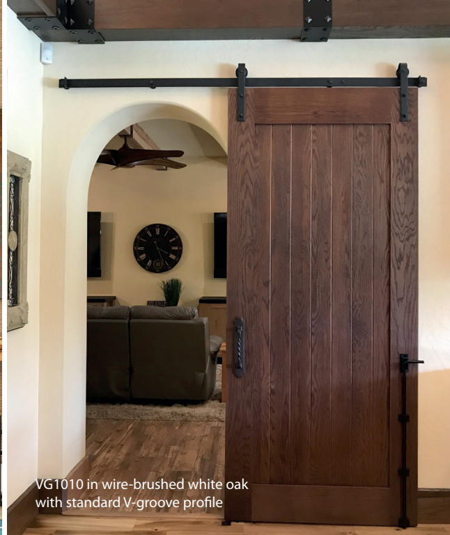
VG1010 in wire-brushed white oak with standard V-groove profile