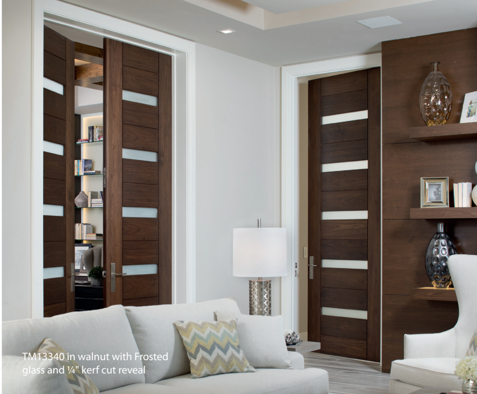
TM13340 in walnut with Frosted glass and 1/4" kerf cut reveal

At TruStile, we believe that every opening is an opportunity to enhance your home's design. Our commitment is to provide today's architects, designers, custom home builders and homeowners with interior doors that support the needs of today's custom projects. Over the next several pages we will walk you through the steps to elevate your next project using interior doors.