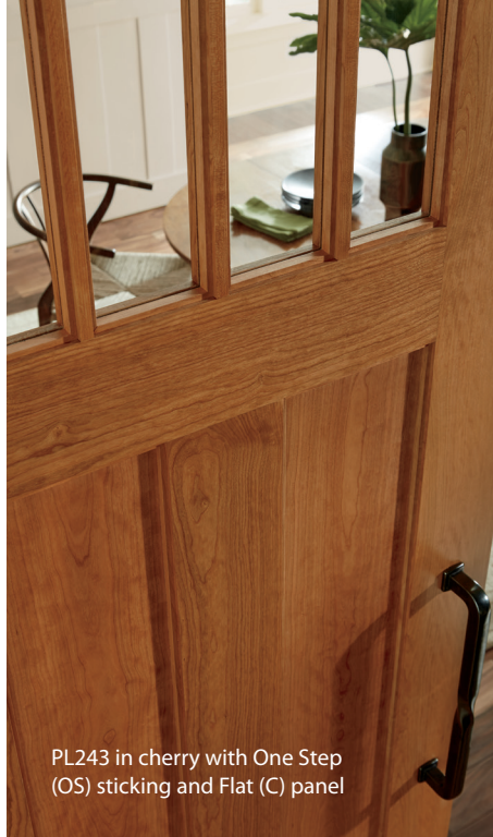
PL243 in cherry with One Step (OS) sticking and Flat (C) panel