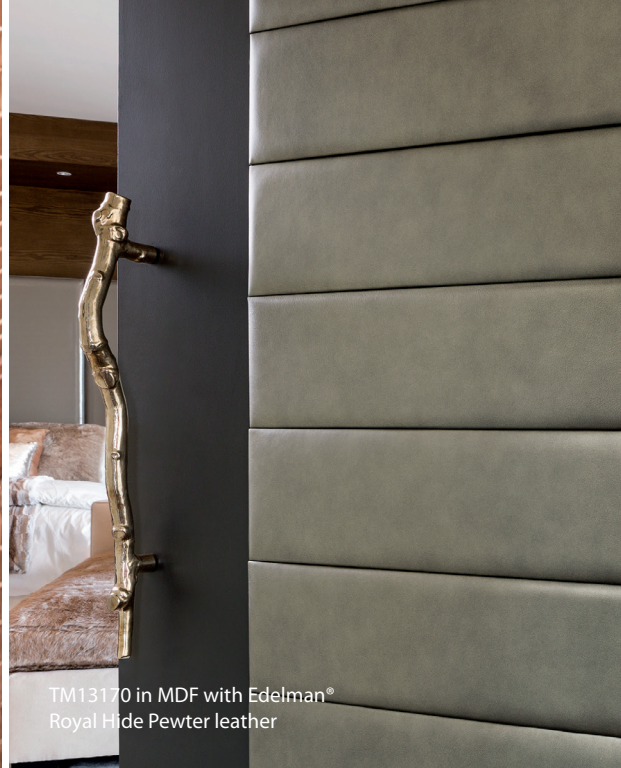
TM13170 in MDF with Edelman® Royal Hide Pewter leather