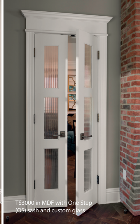
TS3000 in MDF with One Step (OS) sash and custom glass