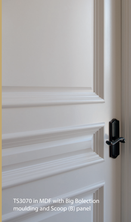
TS3070 in MDF with Big Bolection moulding and Scoop (B) panel