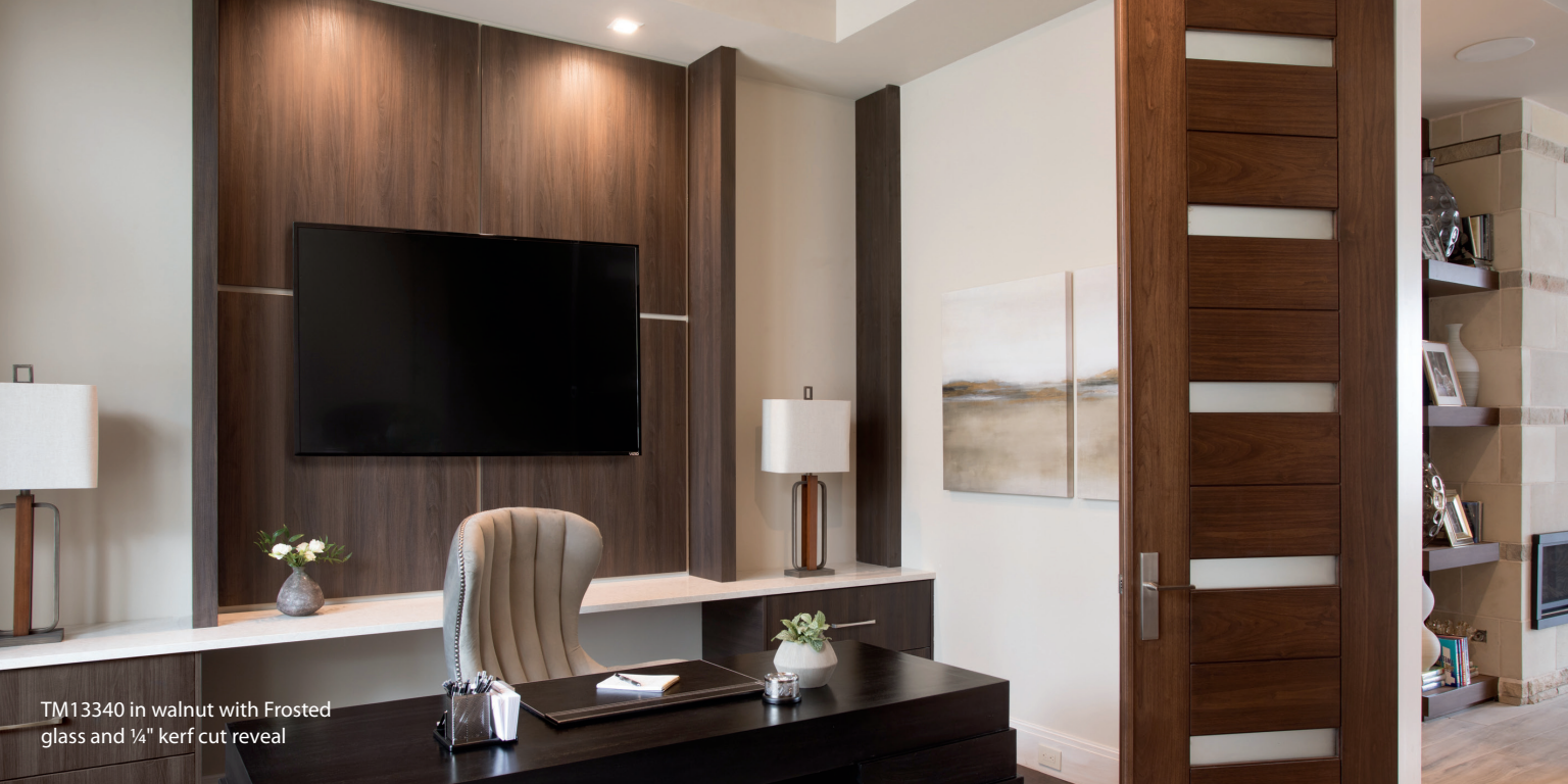
TM13340 in walnut with Frosted glass and ¼" kerf cut reveal