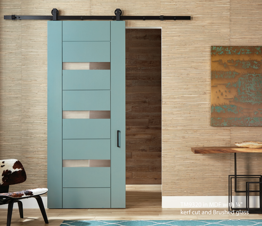
TM9320 in MDF with 1/4" kerf cut and Brushed glass