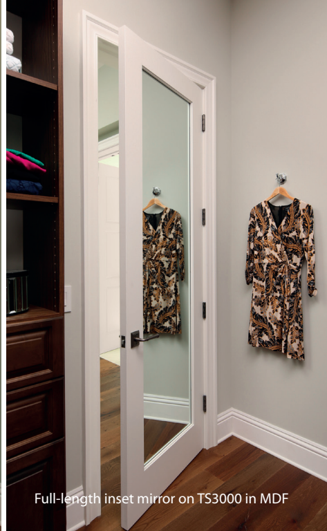
Full-length inset mirror on TS3000 in MDF