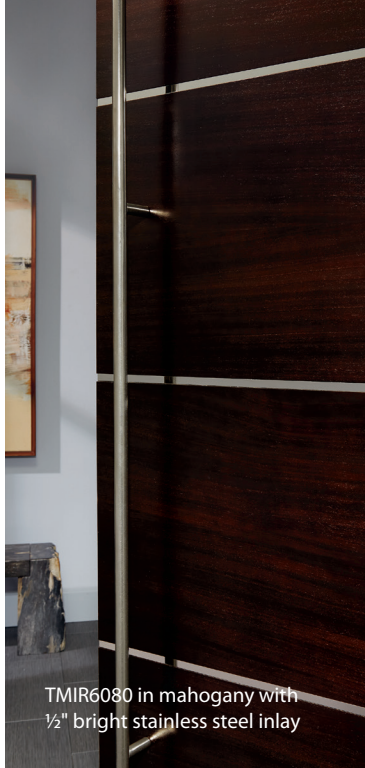
TMIR6080 in mahogany with 1/2" bright stainless steel inlay