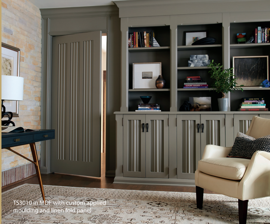
TS3010 in MDF with custom applied moulding and linen fold panel