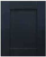
PEARL NIGHT BLUE