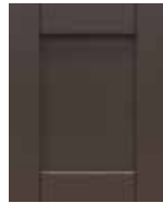
METALLIC BRONZE MATTE