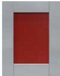
KEY WEST FROST