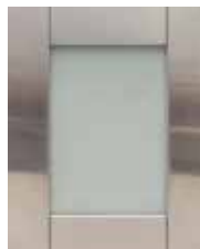
SEAFOAM GREEN SEA GLASS INSERT