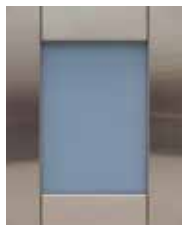
SKY BLUE SEA GLASS INSERT