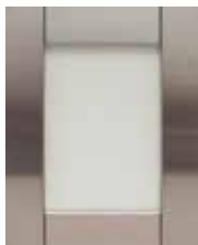
CLOUD WHITE SEA GLASS INSERT